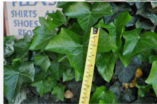
REVERSE OSMOSIS WATER