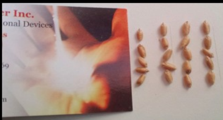
Count out desired number of seeds in minimum groups of 20