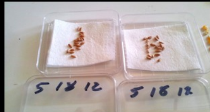
Place seed groups on paper towels in Petri dishes and cover with 1 or 2 layers of paper towels

When these simple procedures are followed, the results are always the same.