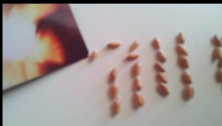
Discard non uniform or damaged seeds