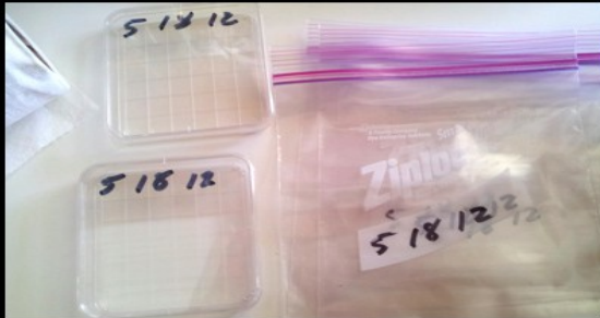
Date all containers