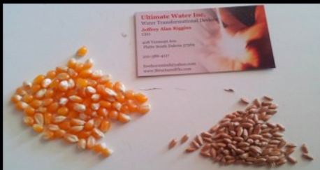
Start with a selecting of seeds