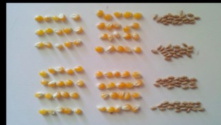
Minimum of 4 Groups of 2 types of seed.