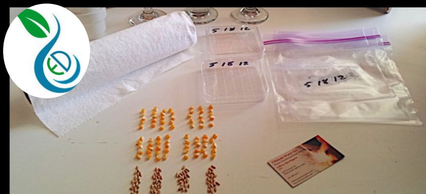
Selected methods of evaluation media petri dishes and ziplock bags using soft absorbent paper towels. Date all containers