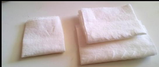
Pre-cut absorbent paper towels to fit containers allowing for at least one fold