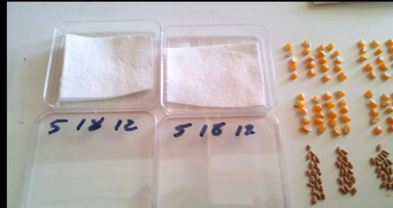
Lay 2 to 3 layers of paper towels in petri dishes