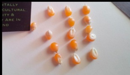
Discard non uniform seeds across all groups